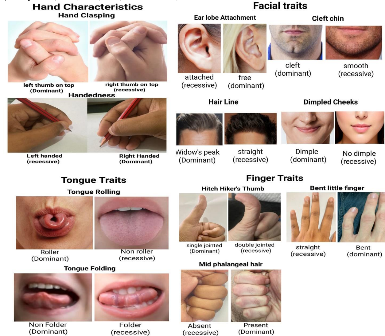
Fig 1. A visual guide to understanding commonly observed phenotypic traits in human Table 1. Distribution Of Observed Morphogenetic Traits In The Sampled Population

2008). However (Razzaq et al., 2015) opposed the above findings. The result showed that only 27.33% of individuals had cleft chins. Likewise, only 15% of the sample had facial dimples. 34.33% of the sample had attached earlobes, and 65.67% had free earlobes. 47.33% of the sample had a widow's peak hairline. These three dominant facial traits (cleft, dimples, and widow's peak) occurred in less frequency while the dominant trait free-ear lobe appeared in high frequency. These results are in consonance with previous studies(Adekoya et al., 2020; DEVI and VANKARA, 2022).