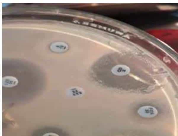
Figure 1 D-test positive and MRSA, *MRSA: Methicillin Resistant Staphylococcus aureus