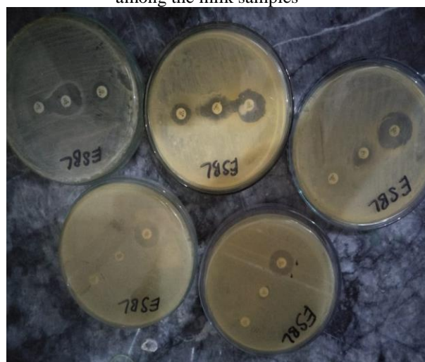
Figure 3: ESBL-producing bacteria among the milk samples