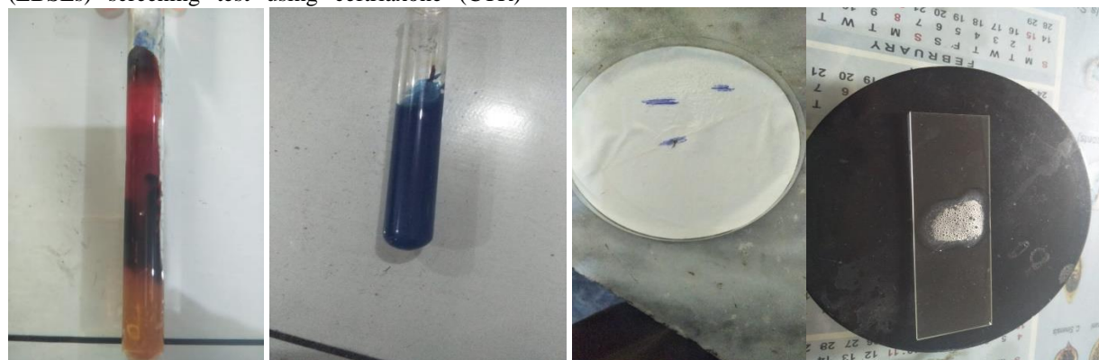
Figure 1: Biochemical characteristics of bacterial pathogens, A) Indole test, B) Citrate test, C) Oxidase test, D) Catalase test

Samples (25) of mammal's milk were collected from the district Peshawar, and isolates were analyzed, and characterized by biochemical tests (Figure 1). Among the isolates, S. aureus and Shigella spp. were observed n= 04 (16%), while E. coli , Salmonella spp., and P. aeruginosa were n= 03 (12%). The occurrence of pathogenic bacteria among different mammals, buffalo, cow, camel, goat and sheep, were observed, as shown in table 1. Collectively, the high microbial contamination was found in Buffalo, Cow, Sheep n= 04 (16%), Goat n= 03 (12%), and Camel n=02 (08%), respectively. The area-wise occurrence is presented in table 2.